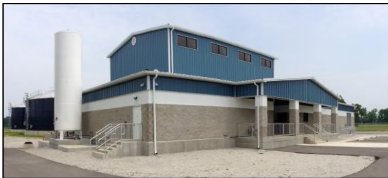
Mahalasville Road Treatment Plant, Morgan County

If you have any questions about this report or concerning your water utility, please contact our office at 812-988-6611. We want our valued customers to be informed about their water utility. If you'd like to learn more, please attend any of our regularly scheduled meetings. They are held on the third Tuesday of each month at 8 a.m. at the office of the Utility, 5130 North State Road 135, Beanblossom, Indiana.